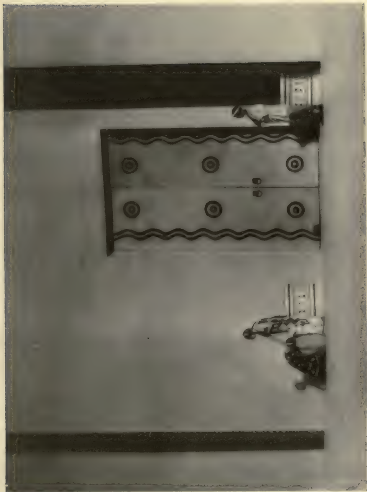
SETTING — LIGHT AND SHADE

(Granville Barker's production of the Iphigenia in Tauris . Yale Bowl)